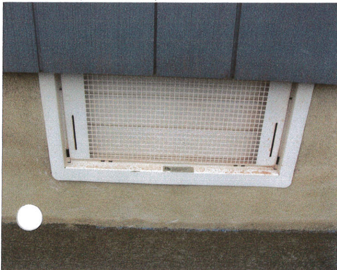
Smart Vents-(Six in House)-Date Taken: 02/18/2009