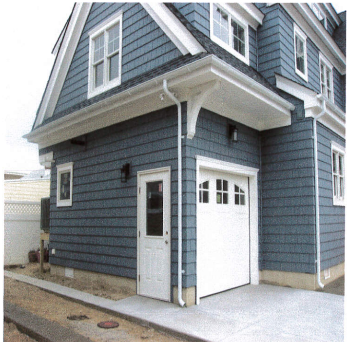
Rear View-Date Taken: 02/18/2009