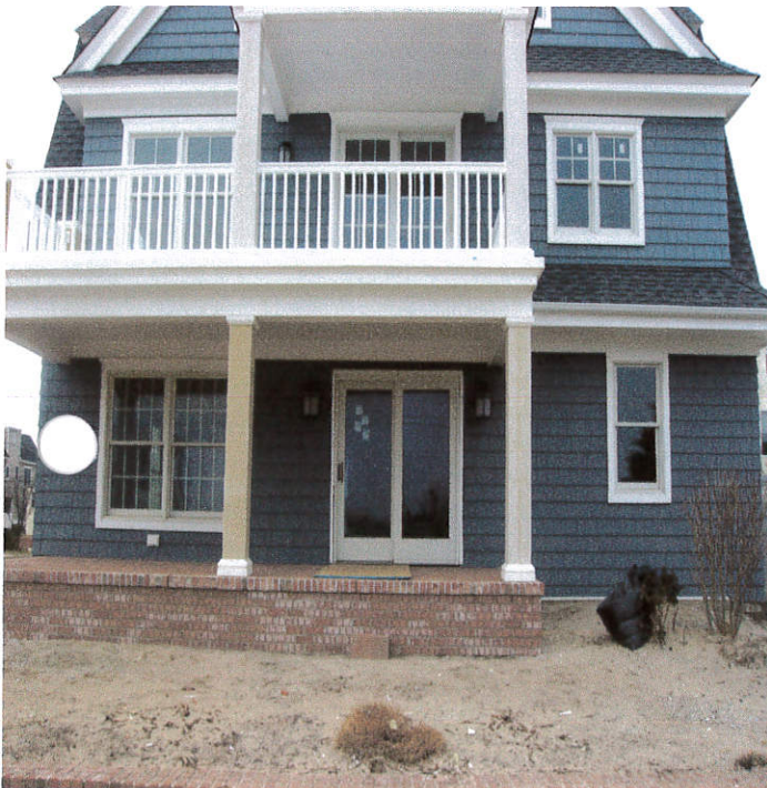
Front View-Date Taken: 02/18/2009